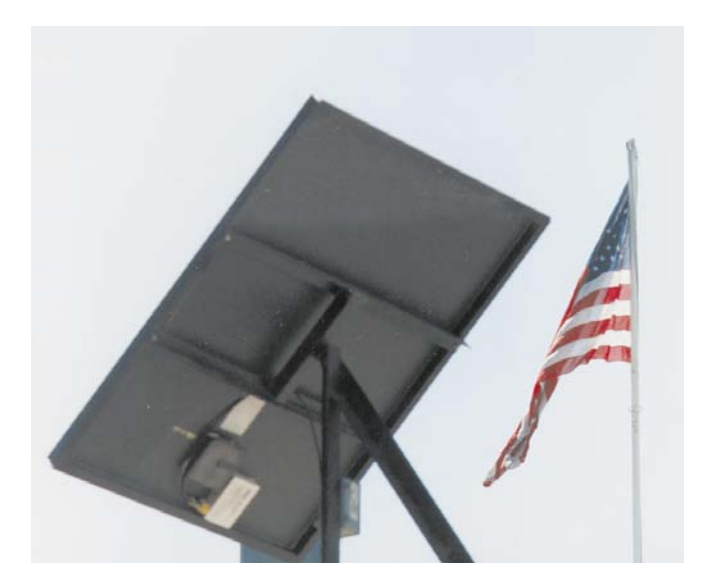
Above: Freedom on the roof!

After four months of use, the AC Module has offset 47,354 watt-hours of consumption in our building. It's a small amount—at ten cents per kWh, that's less than $5. It would take a lot of time to make up for our expenses, but we are not really interested in payback time. We are interested in contributing our fair share to a more just, distributed power system. Oh yeah, we also get a kick out of pulling one over on the utility.