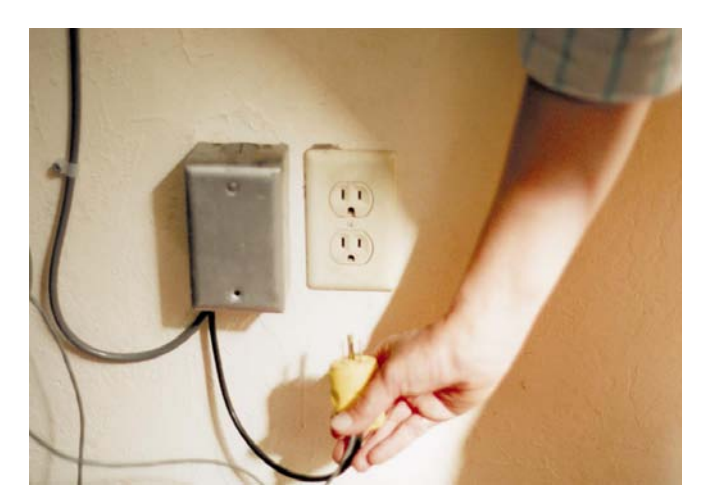
Above: Just plug it in!