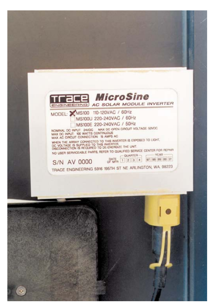
Above: The Micro Sine on the back of the 24 Volt PV.

Not being engineers who can calculate wind loads on paper, we field-tested the mounting system. We wiggled it back and forth as if it was blown by a gusty wind. There was too much flex in the hefty angle iron,